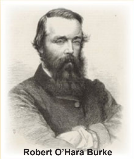
Robert O'Hara Burke